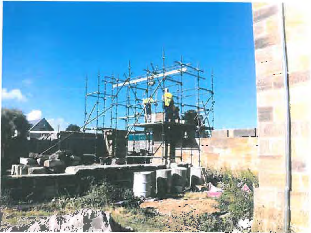
The rebuild progresses June - September 2013