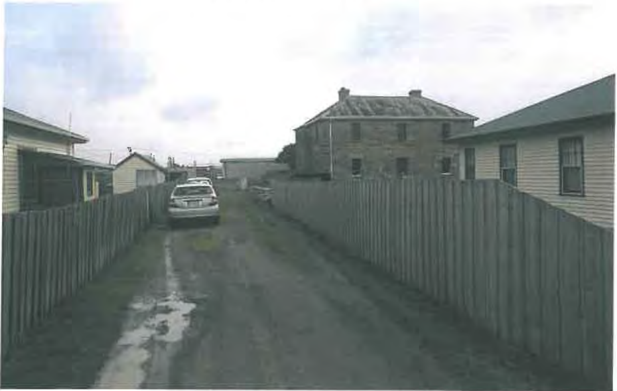
Damage to the Gaoler's Residence and remainder of walls following relocation of the arch