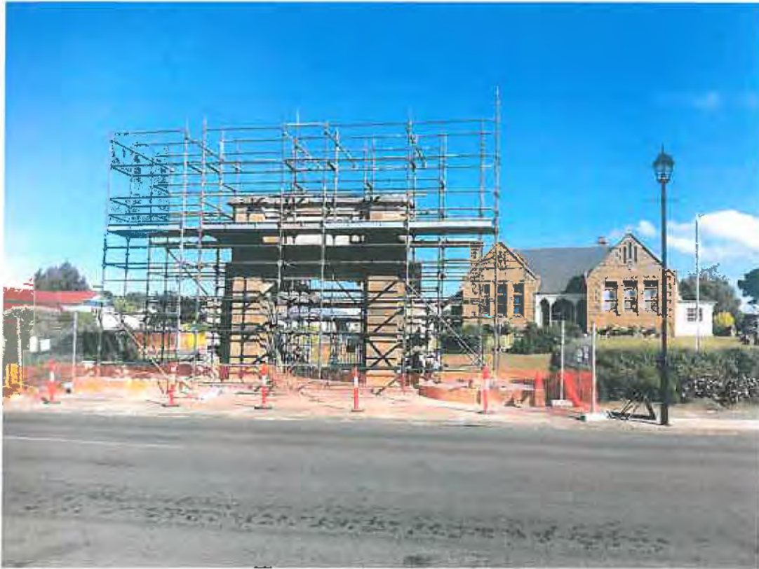
The arch in the process of removal December 2012