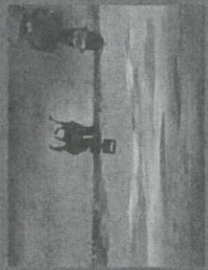
Sidney Nolan The encounter 1946 National Gallery of Australia, Canberra gift of Sunday Reed, 1977

nga.gov.au Street address: Parkes Place, Canberra ACT Postal address: GPO Box 1150, Canberra ACT 2601 Open daily 10.00 am – 5.00 pm (closed Christmas Day) Enquiries (02) 6240 6502 Online feedback form at nga.gov.au/feedback Service Charter at nga.gov.au/servicecharter The National Gallery of Australia is an Australian Government agency