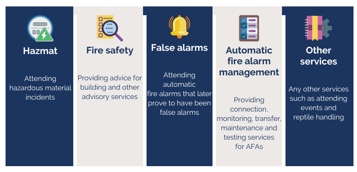
Figure 1.1 FRNSW's services for which IPART recommends user charges

We invite your feedback on our Draft Report (see Section 5 for more information).